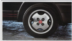
Distinctive Pirelli alloy road wheels.