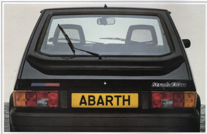
The view most other drivers will see - the Abarth's superb level of specification includes a rear spoiler, rear wash/wipe and impressive impact resistant wrap around bumper.

The Fiat Strada Abarth. An inspiration on the road.