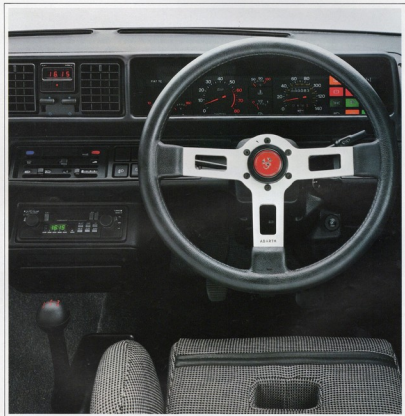
Three spoked sports steering wheel (rake adjustable), a high performance heating and ventilation system and a dashboard that covers everything, right down to oil pressure and temperature gauges. (The radio/cassette is an optional extra.)

Add the mechanical excellence of a close ratio ZF 5 speed gearbox, two twin choke side draught carburetors and an electronic Digiplex ignition system and the Abarth shows you a performance unmatched by any other car in it's class.