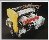
The dynamic Abarth power plant - twin overhead cam 1300 cc engine giving a generous 130 bhp.